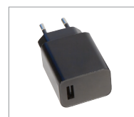
Charger 12 V